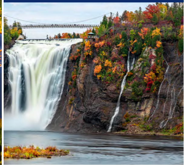
Québec City, Québec