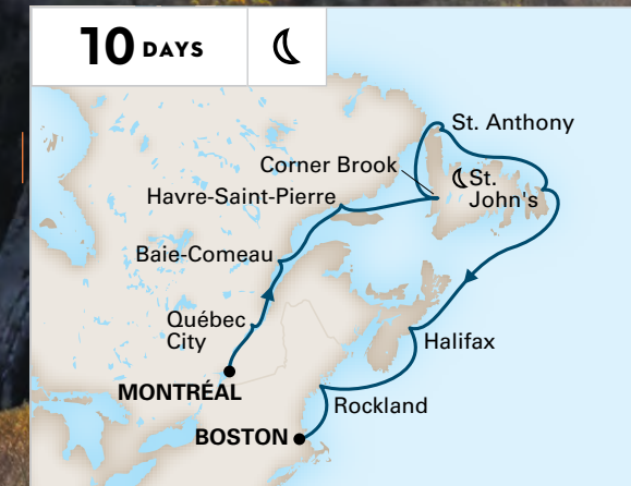
NEWFOUNDLAND & NEW ENGLAND DISCOVERY MONTRÉAL TO BOSTON Volendam Aug 31