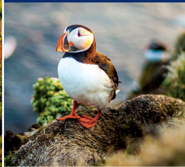
Sydney, Nova Scotia