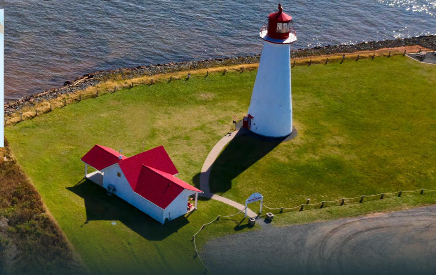
Point Prim Lighthouse, Prince Edward Island