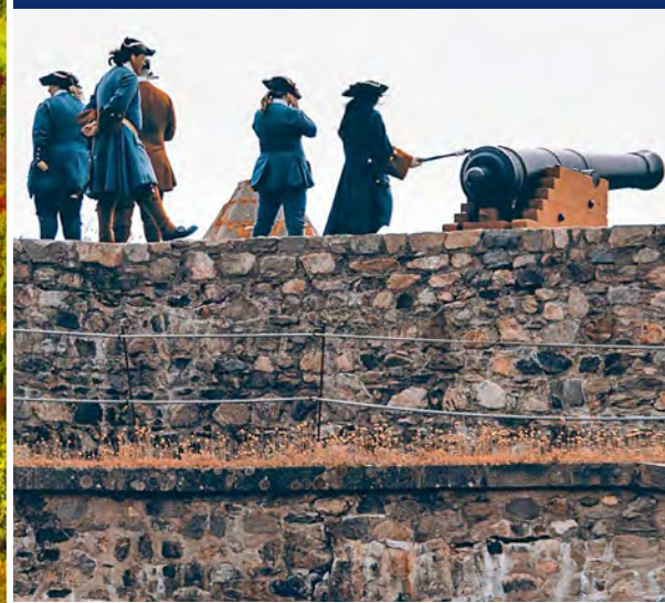
Cape Breton, Nova Scotia