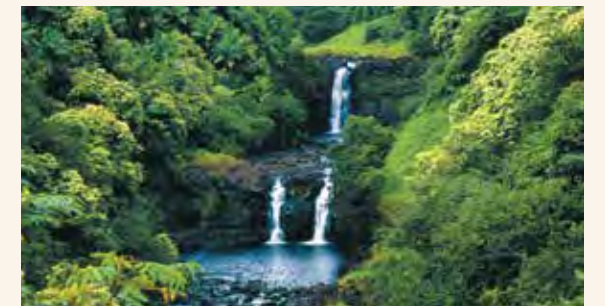
Unique and beautiful Umauma Falls