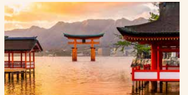
Miyajima torii gate, Hiroshima, Japan