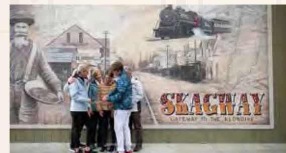
Experience frontier living in Skagway, Alaska