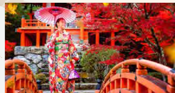
Autumn in Kyoto, Japan