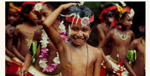
Make new friends in Papua New Guinea