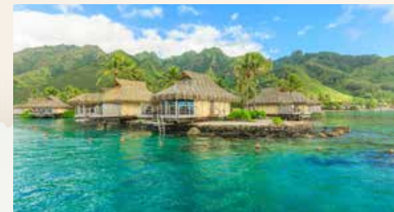
Overwater bungalows in Papeete, Tahiti