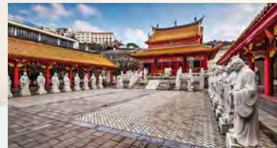
Koshibyō Shrine, Nagasaki, Japan