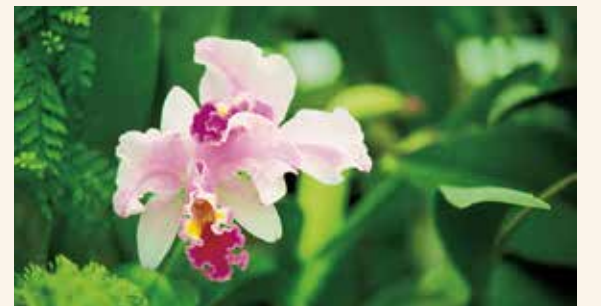
Breathe in beautiful native flora