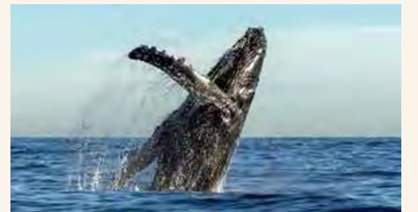
Witness marvelous marine mammals