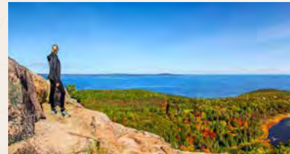
Take in coastal Canadian views