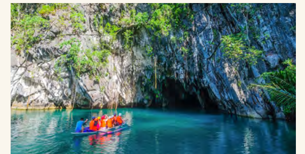
Puerto Princesa, Philippines