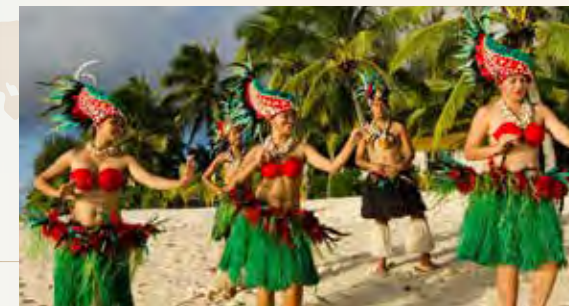
Immerse yourself in island traditions