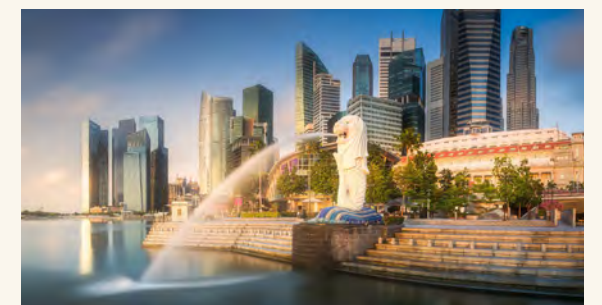
Magnificent Marina Bay, Singapore