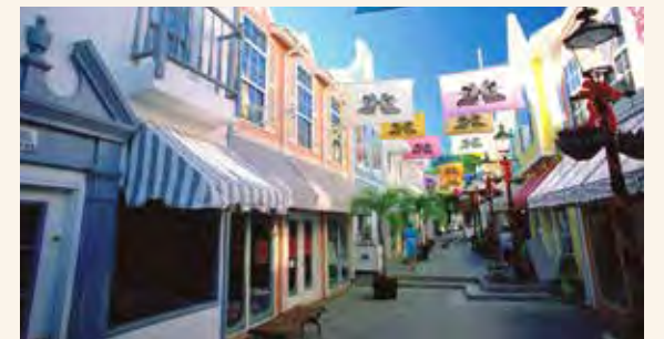
Visit Dutch-flavored St. Maarten