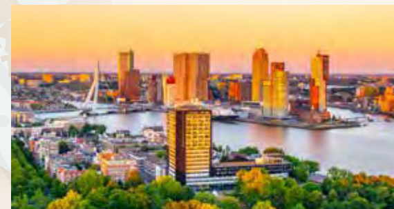
Visit our hometown of Rotterdam, the Netherlands