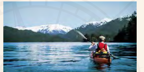
Kayak through pristine waterways