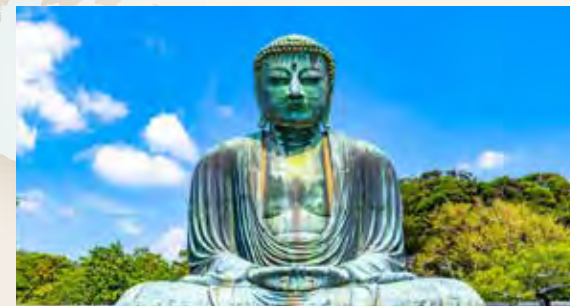
Great Buddha of Kamakura

Uncover a world of breathtaking scenery, gilded temples, modern cities and enduring cultural traditions in Alaska, Japan and Hawaii.