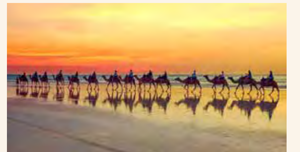
Enjoy a sunset camel ride in Broome