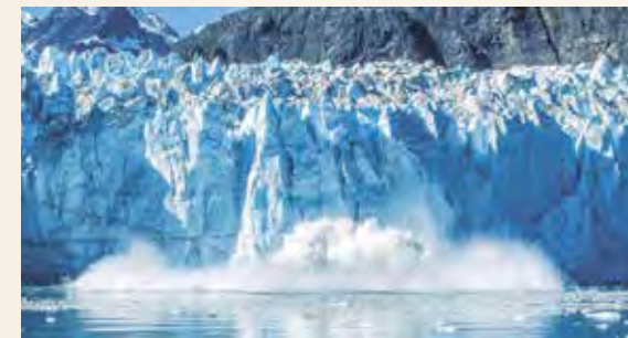
Glacier Bay National Park, Alaska

Spend the Summer Solstice at the Arctic Circle while cruising your way through Alaska's perennial favorites and hidden treasures.