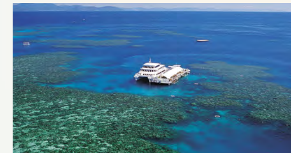
Sail Australia's Great Barrier Reef