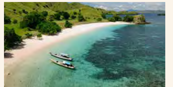
Marvel at Komodo Island's fierce reptiles

Evening Stay. Departure between 10:00 p.m. and midnight. Extended Stay. Departure leaving the next calendar day.