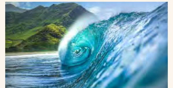
Soak in turquoise Tahitian seas