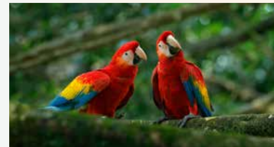
Delight in Amazonian wildlife