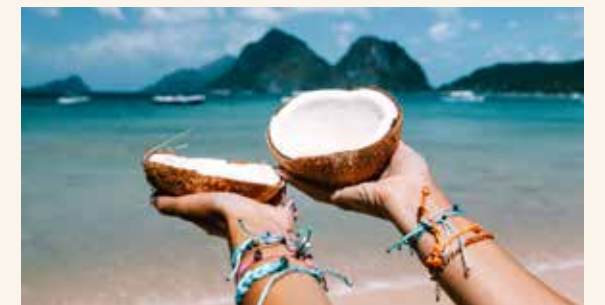
Sample a taste of local fruit