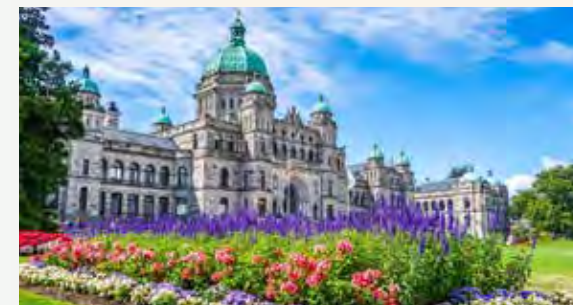
Charming Victoria, British Columbia