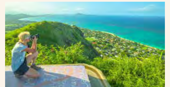
Survey tropical forests