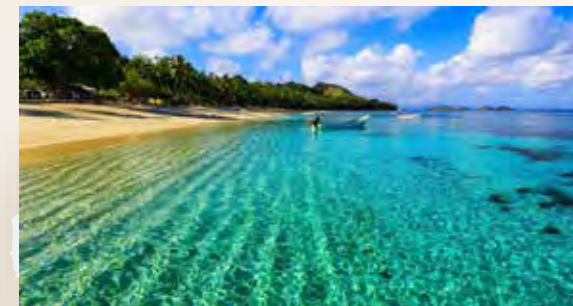
Refreshing turquoise water

Stroll pristine white- and black-sand beaches, swim with sea turtles, and marvel at kaleidoscopic coral reefs as you cross the Pacific Ocean.