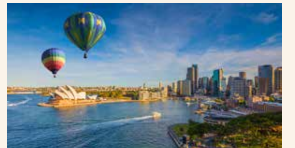
Sail spectacular Sydney Harbour