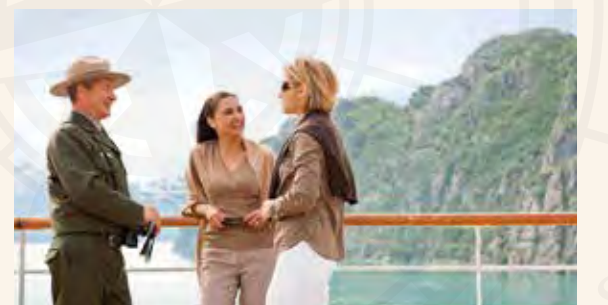
Onboard experts help you delve deeper