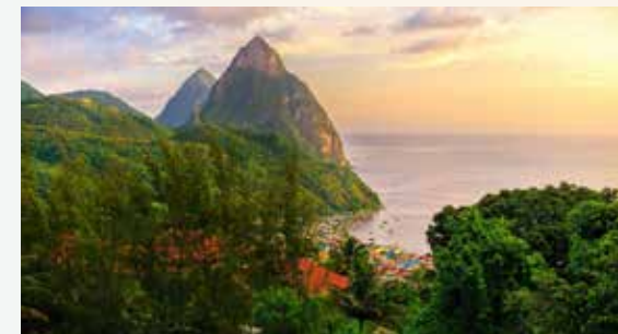
Marvel at St. Lucia's towering Pitons

Sail open seas and a storied river on this spectacular voyage from the Caribbean Islands to the Amazon rain forest and back.