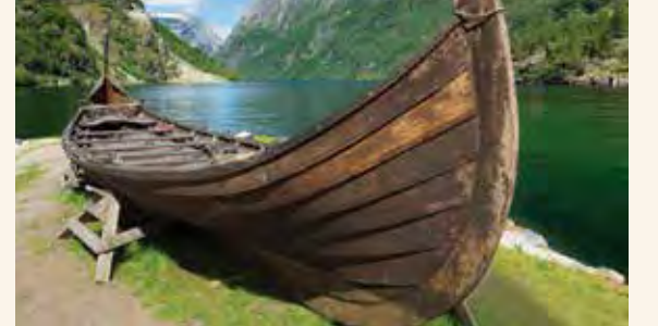
See perfectly preserved Viking artifacts