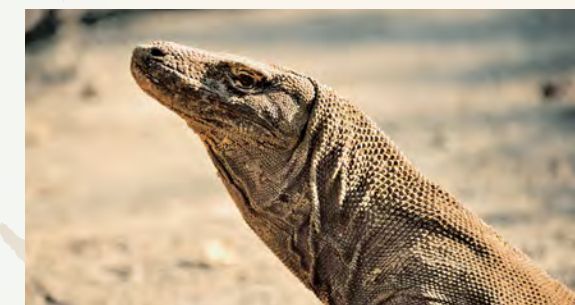
Meet Earth's largest lizards