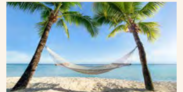
Wind down underneath palm trees