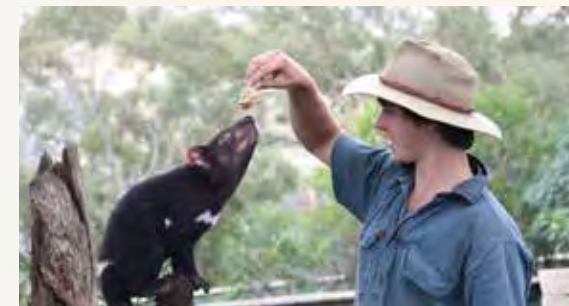
Meet Tasmania's famous devils

Encounter amazing wildlife, world-renowned wines and the jaw-dropping Great Barrier Reef as you circle Australia.