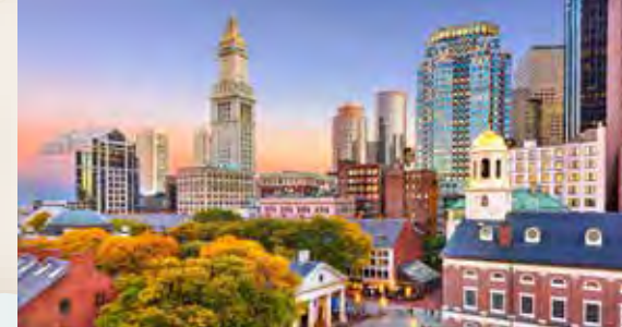
Explore historic Boston, Massachusetts