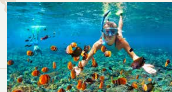
Get close to sea life