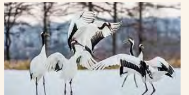
Graceful Japanese cranes