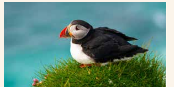
Admire colorful puffins at play