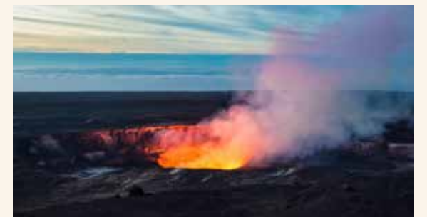
Kilauea Volcano, Hawaii

Evening Stay. Departure between 10:00 p.m. and midnight. Extended Stay. Departure leaving the next calendar day.