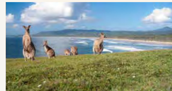
Kick back on Kangaroo Island