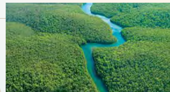
Sail the storied Amazon River