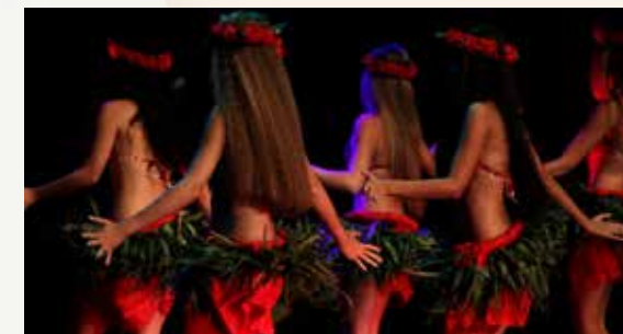
Experience local cultures