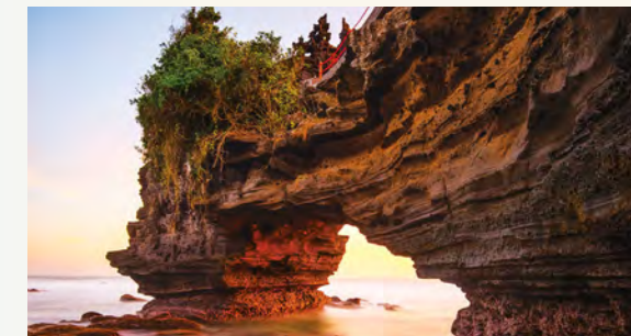
Batu Bolong sea temple, Bali, Indonesia

Collect a lifetime's worth of memories as you cruise through majestic straits, volcano-laced seas and stunning coral reefs.