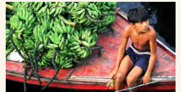
Encounter friendly locals