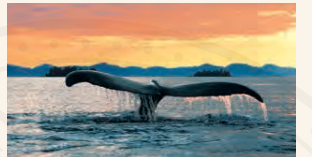
Keep watch for whales