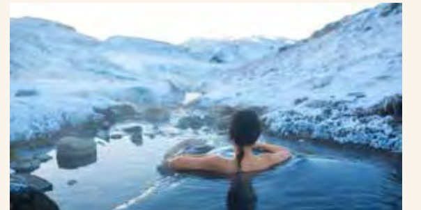
Immerse yourself in Iceland's majestic fjords