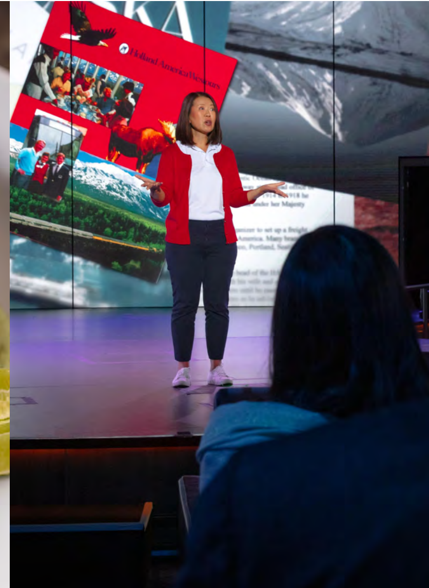
Onboard experts share insights into history and culture