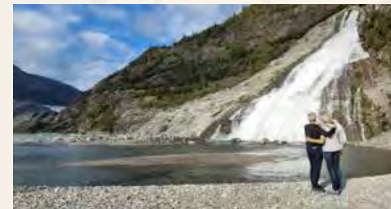
Nugget Falls, Tracy Arm Fjord, Alaska