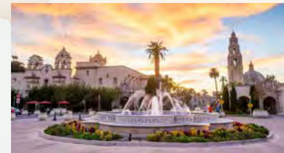
Balboa Park, San Diego