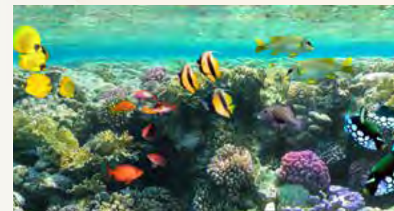
Uncover an underwater world