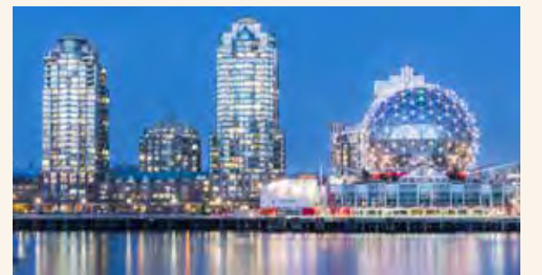
Vibrant Vancouver, British Columbia

VISIT HOLLANDAMERICA.COM OR CONTACT YOUR TRAVEL CONSULTANT TODAY.