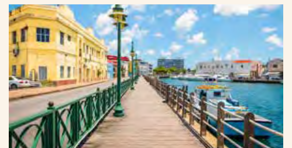
Explore historic Bridgetown, Barbados