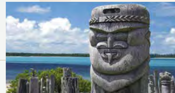
Ancient figure, New Caledonia