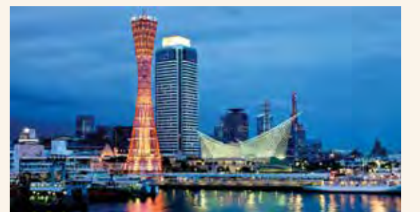
Marvel at modern architecture

⚓ Extended Stay. Departure leaving the next calendar day.